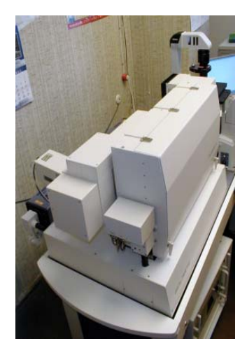
3D scanning confocal microscope with spectrometer

Obtaining fundamental knowledge of the local atomic and electronic structure, its relation to physical and chemical properties of the modern multifunctional materials. Discover the possibilities to use the borderlayer processes in mono- and multilayer nanostructures for the new generation of surface-active sensors and ultrahard coatings. Developments of light emitters, detectors and visualization systems on oxyfluoride nanocomposite basis with enhanced quantum efficiency.