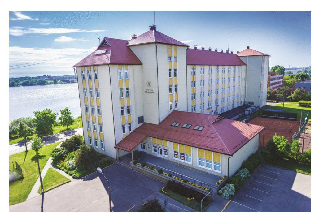
ISSP UL building in 2012

Website of the Institute of Solid State physics: <a href="http://www.cfi.lu.lv/eng/">http://www.cfi.lu.lv/eng/</a>